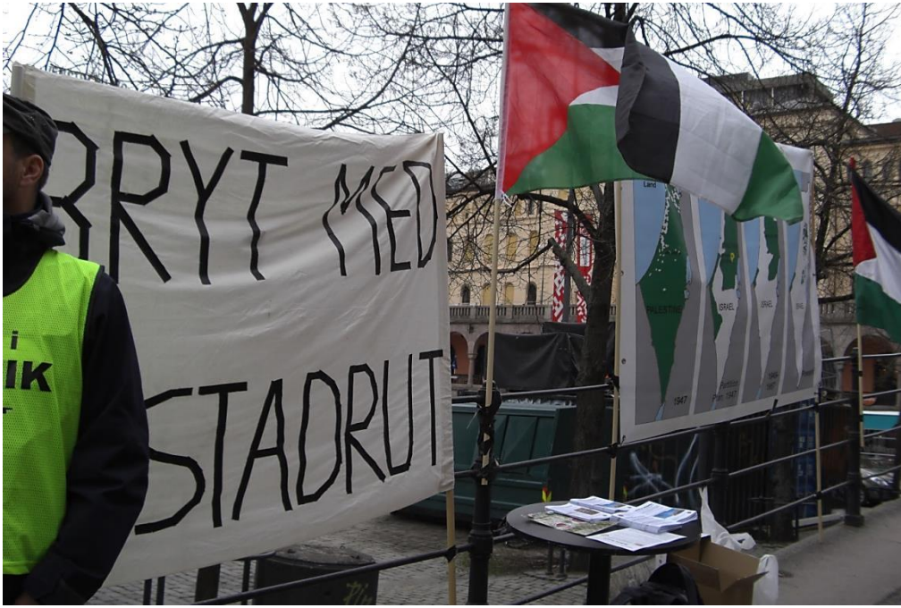
“Break ties with Histadrut” and “End the occupation!”